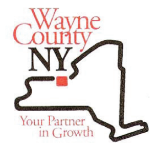
The Wayne County Industrial Development Agency